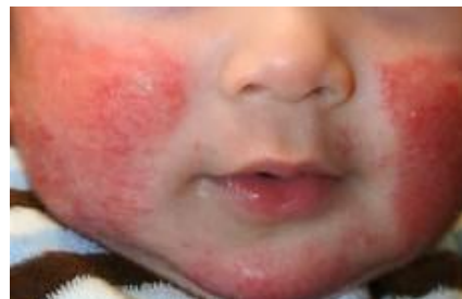
Figure 3: Atopic dermatitis of a child [29]

In atopic dermatitis patients disturbance of the outermost barrier layer of the skin is observed due to mutation in the filaggrin gene .[30] . This affects water permeability, leading to increased trans -epidermal water loss [31].Increased lamellar body secretion was demonstrated with coincidental clinical improvement after wet-wrap dressing treatment of atopic eczema [32]. Similar effects on the restoration of the skin barrier were described after application of liposomes on the skin. Due to the similarity between the structure of the liposomes and the lipid layers of the stratum corneum, the liposomes bind to the keratin layer of the stratum corneum and form a thin occlusive film, which reduces trans -epidermal water loss giving the patient immediate relief from the