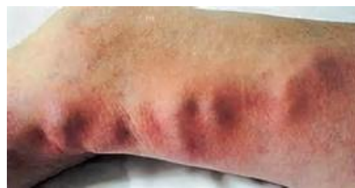
Figure 5: Thrombophlebitis on leg [56]

Thrombophlebitis is vein inflammation related to thrombus (blood clot). Its symptoms include pain, skin redness, oedema and inflammation.