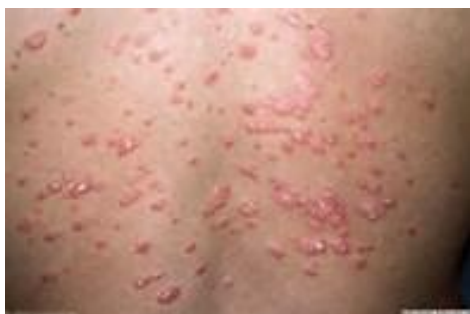
Figure 4: Psoriasis on the back [36]

Psoriasis is a long-lasting autoimmune which is characterized by patches of abnormal skin. These skin patches are typically red, itchy, and scaly. They may vary in severity from small and localized to complete body coverage. Injury to the skin can trigger psoriatic skin changes at that spot.