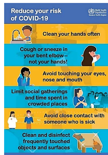
Fig 3: Image of Reduce risk of COVID-19

Ref: Image collected from Google images search